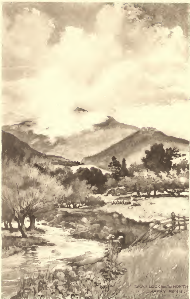
GRAY LOCK from the NORTH HARRY FENN.